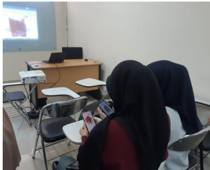
Figure 4. Students Exploring Mathematics Concepts With Geogebra On Mobile Phones

Such visual aids confirmed symbolic computations and expanded students' reasoning. The visual of a steep arrow pointing northeast made the abstract idea of “steepest ascent” concrete. Sung et al. (2025) highlight that such multimodal engagements promote deeper conceptualization (Sung & Nathan, 2025; Yeh et al., 2025).